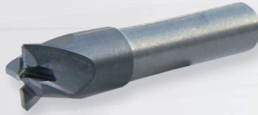
Ø 10 x 44 mm Art.-No. 627022