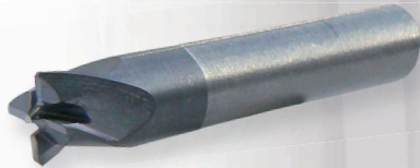
Ø 8 x 44 mm Art.-No. 627020