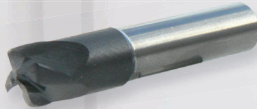
Ø 9 x 44 mm Art.-No. 627021