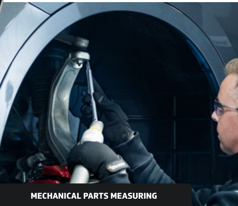
MECHANICAL PARTS MEASURING