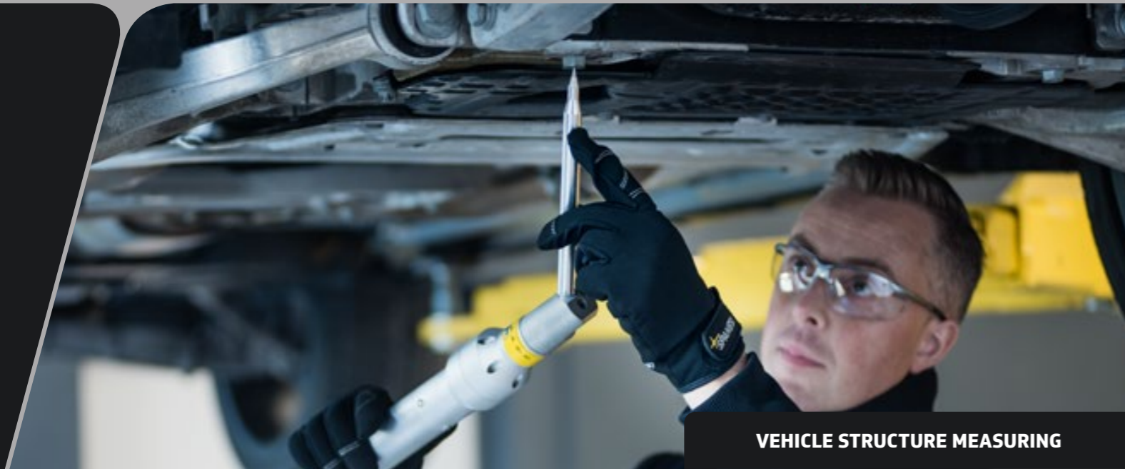
VEHICLE STRUCTURE MEASURING